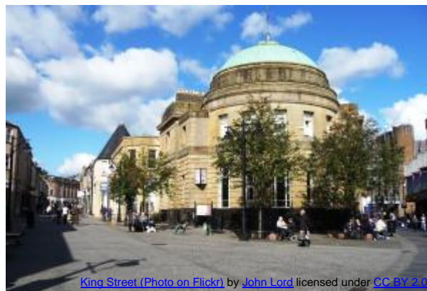
King Street

The county of East Ayrshire has been working on improving the sustainability of its school meals since 2004, making it perhaps the earliest sustainable school food service in the United Kingdom. The area has lower levels of employment, qualifications and average earnings than the Scottish average. This difficult outlook is coupled with lower life expectancy than the national average and rising levels of obesity in school children.